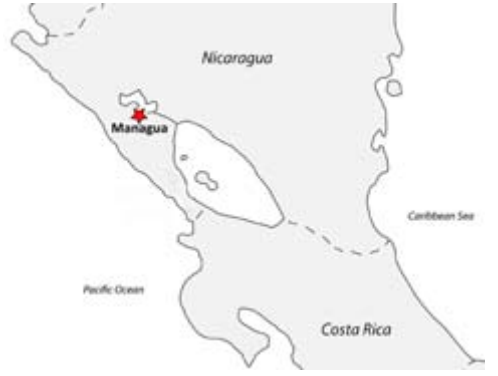
Figure 1. Location of Managua City, Nicaragua.