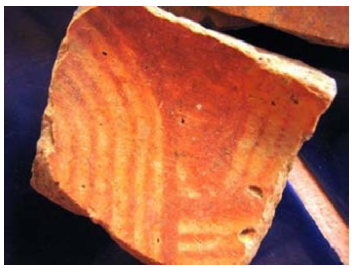
Figure 3 . An Izalco style Usulután sherd from La Arenera [McCafferty, 2009].