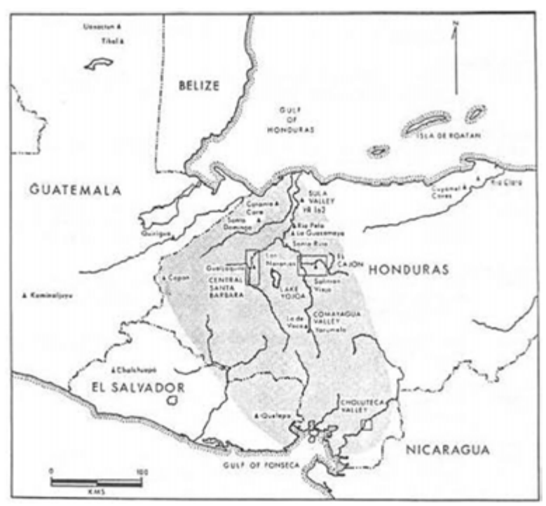
Figure 6. Map of the Uapala Ceramic Sphere Boundaries (after Robinson 1988, in Goralski 2008:1992).

and likely languages (Lenca) east of the Rio Lempa, in El Salvador and Honduras (the traditional southeast periphery), and is differentiated from the earlier Middle Preclassic 'Provedencia and Miraflores spheres' of Maya-speaking Mesoamerica proper (western El Salvador and southwest Guatemala — the Usulután 'heartland') [Cagnato, 2008: 54; Goralski, 2008: 911.