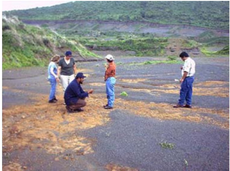
Figure 2. The archaeological surface with volcanic sand layer in profile behind [McCafferty, 2009].

Black-on-Red. Also present in the excavations were obsidian materials—possibly from the Guinope source in Honduras. It may be that earlier occupations exist at La Arenera but the brevity of excavations in 2000 did not permit deeper stratigraphic exploration. Above the layers of volcanic sand